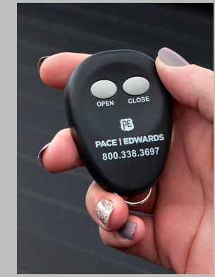
Ultragroove Electric opens easily with the push of a button. remote operation.