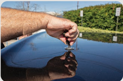
[14] The SnugLid features a waterproof lock.