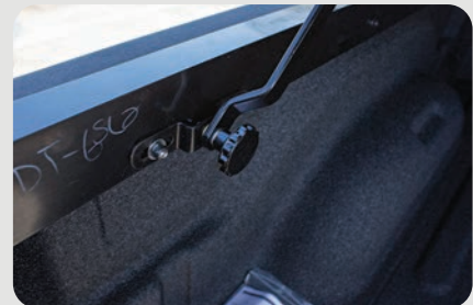
[16] If the lid needs to be removed, a simple pull of the handles and struts removes the cover from the brackets.