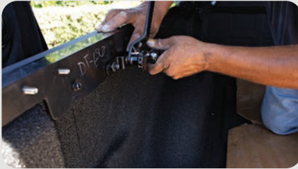
[10] The hinges are secured to the brackets on the side bed rails, and the gas struts are secured from the lid to the brackets.