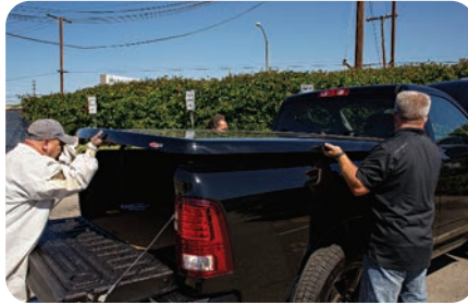
[09] The SnugLid SL is placed over the bed and adjusted until an even one-finger gap all around is achieved.