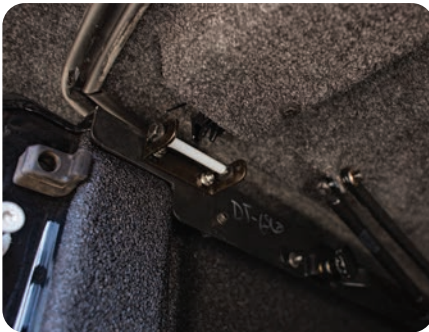
[12] The latching rods are adjusted for proper fit.