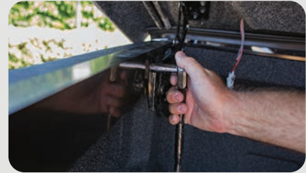
[11] The front brackets are tightened.