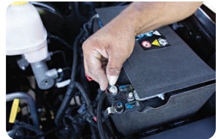
[13] The last step is to ground the black wire and run the red power wire to one of the power terminals on the battery for the light.