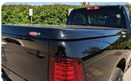
[18] The SnugLid SL contours nicely to the bed of the '13 Ram truck and came painted to match as well!