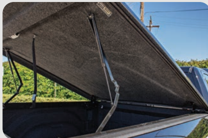
[15] The thin hidden hinges remain out of the way of any cargo. The underside is lined with carpeting that can be easily cleaned.