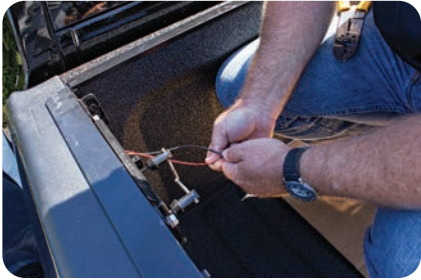
[08] The power and ground leads needed for the light are run through a drain plug and underneath the truck inside of the frame.